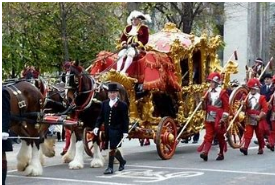
The Lord Mayor's procession

The basis for our existence and mission is our Christian faith. This has always been the case. Our compassion and care is based on the love of God which shines into our lives and governs our actions. The 'untouchables' are equal objects of his love whatever their personal religion or lack of it and we are the eyes, hands and feet of our Lord in sharing and delivering that love with and to them.