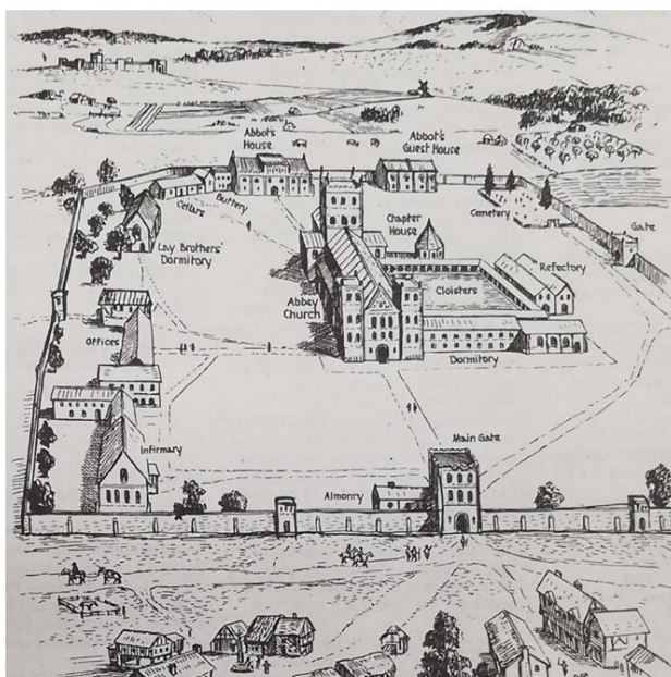
Burton Lazars' Preceptory – Impression – Melton Times 2 September 1999

The Headquarters of the Order at Burton Lazars survived the initial Dissolution of the Monasteries, but was surrendered to the crown on the 4th May 1544.