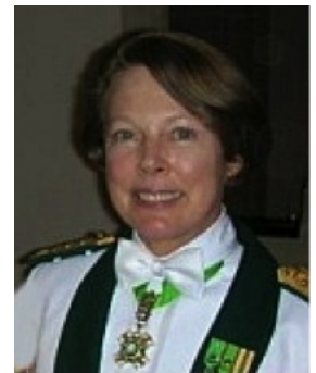
The Grand Chancellor