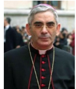
The Ecclesiastical Grand Prior

The year ahead will be active and the Council hopes to share many helpful advisements and guidelines in the name of the Grand Master and the Ecclesiastical Grand Prior.