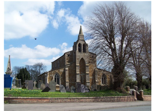
The modern church at Burton Lazars

The 14 th century Black Death epidemics saw an apparent decline in the number of lepers. Together with a changing attitude towards lepers, this led to a decrease in the number of leproseria institutions needed. In England, St Giles leprosarium at Holborn housed 40 inmates when transferred to the Order's management. By 1345, the staff of eight carers were catering for 14 lepers, and by 1402 was catering for only four victims. However, the hospitaller activities expanded to outside the leproseria supporting lepers in the community. In 1479 at Burton Lazars in England, the establishment was obliged to support 14 lepers who if not institutionalized were supported by paying them 'a weekly sum of money for the necessities of life'.