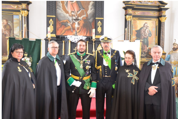
On 4 May 2019, the Grand Master travelled to Lubovna to take part in the celebrations for the 83rd anniversary of the Grand Priory of Slovakia

I have visited Australia, New Zealand, Sweden, Slovakia, USA, Austria, Malta, Portugal and attended events in Spain. I learnt that the Order is full of kind, amusing and intelligent people and so much more can be achieved if we just try and organize ourselves a bit better.