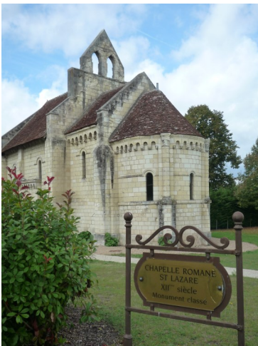
The St Lazarus chapel at Noyers, Loire

The political turmoil of 16 th century saw the Order split up into regional components with loyalties to the local rulers. It also gradually assumed a more military role to become by the end of the 16 th century an honorific order of chivalry awarded for services rendered by the French king. An attempt was made by the French king in 1722 to strengthen the hospitaller function of the Order and place all the hospitals in the realm under the Order's management. The French Revolution put philanthropy on the backburner. However, following the Bourbon restoration and the loss of Royal protection in 1830, the French Order assumed a new hospitaller role supporting philanthropic activities in the Holy Land – a raison d'être eventually entrenched in the 1910 statutes. In the aftermath of the Second World War, the Order expanded its activities to an international perspective with unlimited scope.