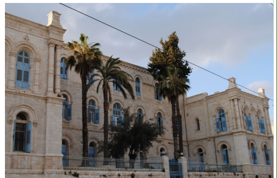
St Louis Hospital, Jerusalem