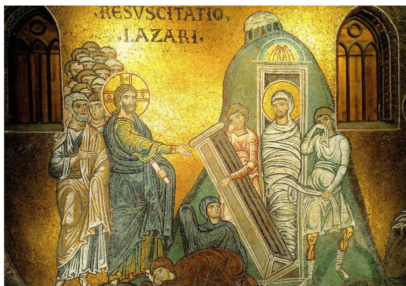
The Lazarus mosaic, Monreale Cathedral, Sicily